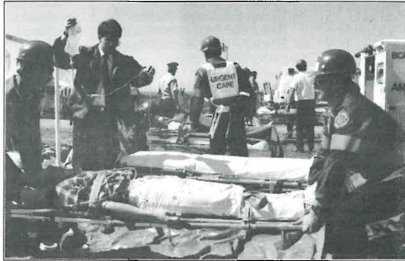
Together with Vancouver international airport staff, three of the JI's academies — police, fire and emergency health services — took part in a simulated airport disaster exercise in July.