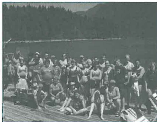
BCPFF Burn Camp 2002 - Group shot of senior campers and their counselors. Over four hundred children between the ages of six to 18 have attended Burn Camp in its nine years of operation. In 2002, forty fire fighters, burn unit doctors, nurses, and adult burn survivors donated their time as counselors to seventy children.

The BC Professional Fire Fighters' Burn Fund has upgraded its website, www.burnfund.org . Easy to use and informative, the site is designed to provide timely content for fire fighters, burn survivors and their families, health care professionals and the public sector. Areas covered include Education and Prevention Programs, featuring Burn Awareness Week, the BCPFF Burn Unit at VGH, Burn Survivor Support and Burn Camp , plus fundraising events sponsored by fire fighter locals around the province.