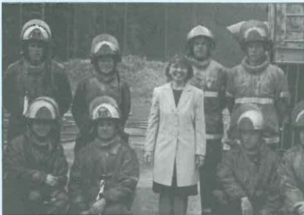
Minister of Advanced Education, The Honourable Shirley Bond, visits the Maple Ridge Campus (PSTC).

Advanced Education Minister Shirley Bond announced in September that the Justice Institute of B.C. received the go-ahead to proceed with a capital project to enhance the live fire training site in Maple Ridge.