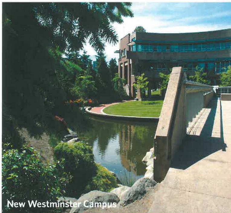
New Westminster Campus

A student notice board is also available for posting messages, and is located near the lunchroom.