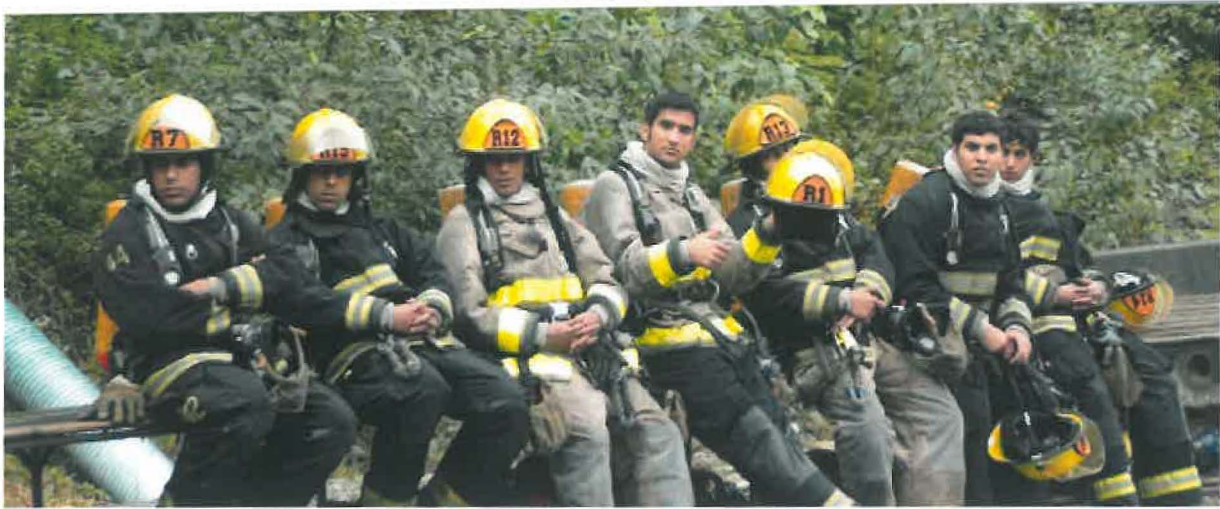
Students from the United Arab Emirates at the Justice Institute of BC's Maple Ridge campus.