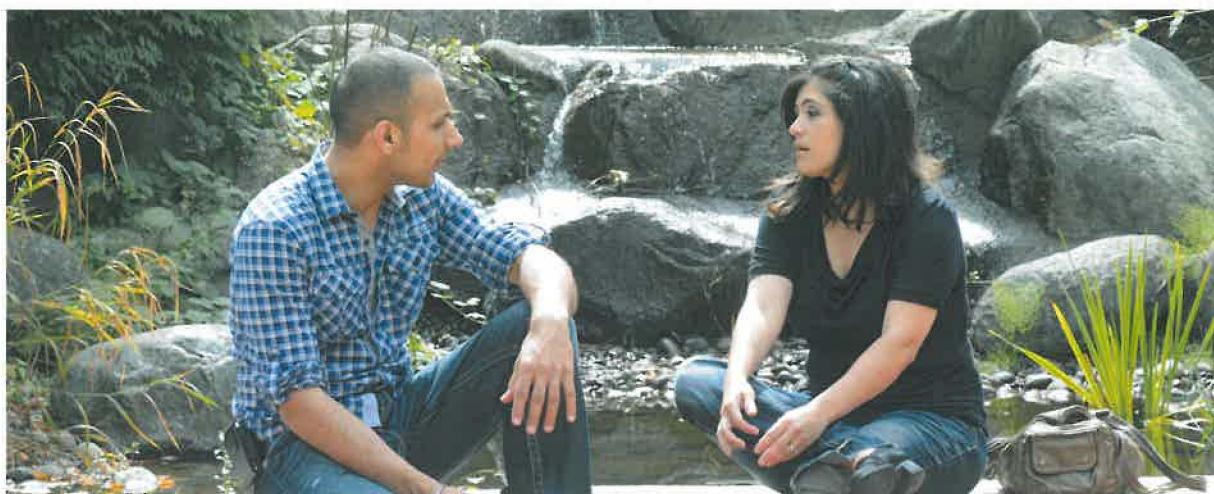
Students in the Law Enforcement Studies Diploma program.