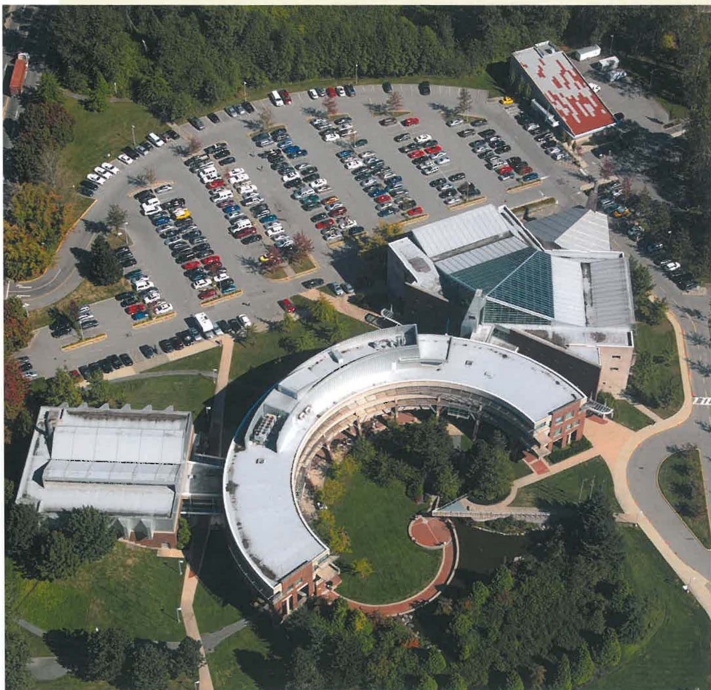
Justice Institute of BC - New Westminster campus