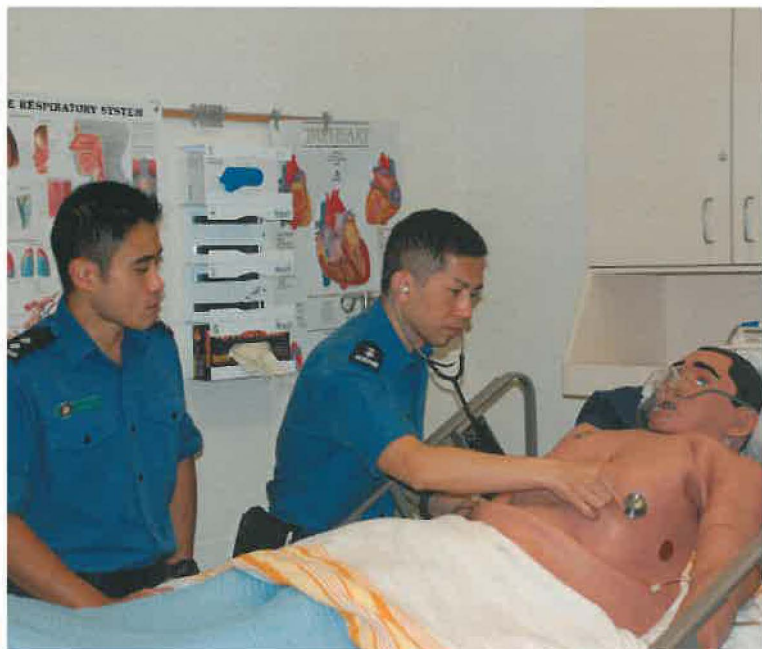
Hong Kong Ambulance Command students practice skills on a high fidelity mannequin at Justice Institute of BC.

For over a decade, the Justice Institute of BC School of Health Sciences has trained instructors and other staff with the Hong Kong Fire Services Department Ambulance Command and provided program accreditation.