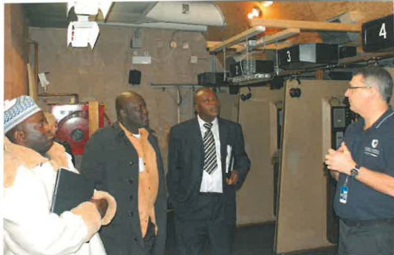
A visiting Nigerian delegation in the firearms range.