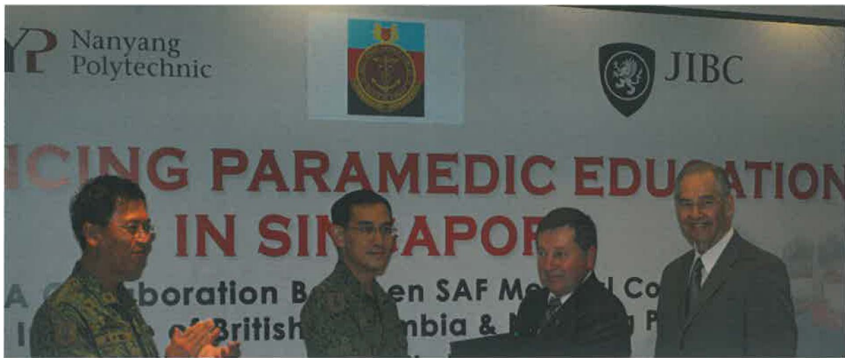
The Justice Institute of BC School of Health Sciences signed an MOU with the Singapore Armed Forces in 2010 to develop a partnership in the design and delivery of education for paramedic and pre-hospital care.