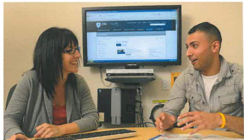
Students in a study room in the Justice Institute of BC Library, which has an extensive collection of justice and public safety resources.

As part of a contract with a large government agency in the United Arab Emirates, the Justice Institute of BC's Fire & Safety Division is providing professional fire training to 43 learners, who are working toward a Fire Service Leadership Diploma.